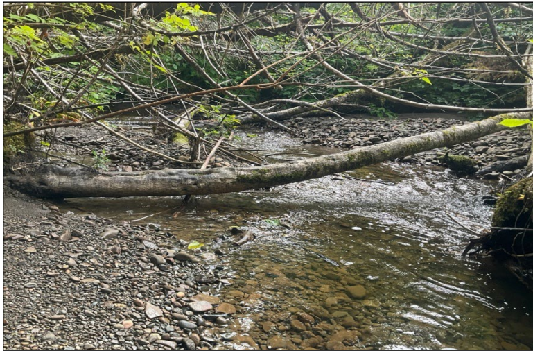
Figure 1.—Looking upstream at waypoint 1181.