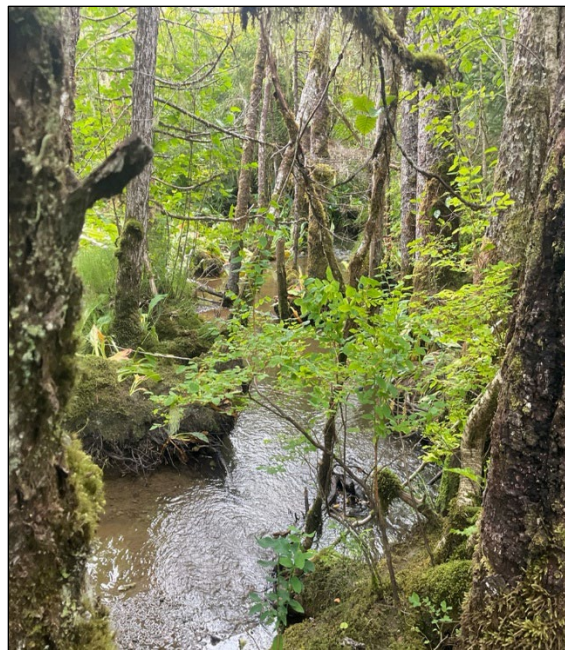
Figure 3.—Stream going south of the bridge at waypoint 1185.