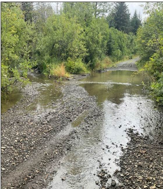
Figure 2.—Braid crossing the road at waypoint 1183.